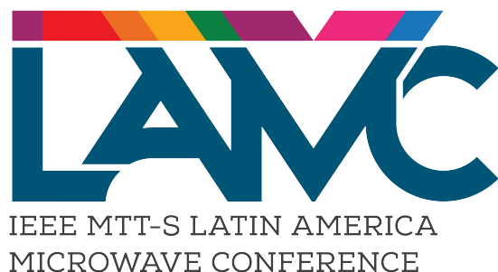
Fig. 2. General official logo for the IEEE MTT-S Latin America Microwave Conference. This logo can be used in the power-point conference presentation.

Table I was implemented in the above fashion also, using [t] in a table environment. Table I also illustrates one of the rare instances when the double column format requirement can be violated. Certain figures and tables will require the full page width to display. It is usually best to place these figures and tables at the top or bottom, rather than in the middle, of a page.